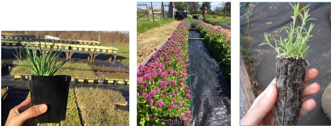
Photos, left to right: Sisyrrinchium idahoense 4" pot; sea blush seed production; Cerastium arvense plug.

Please bear in mind that some of our native species require fall sowing in order for germination to occur, which can mean planning for your project well in advance.