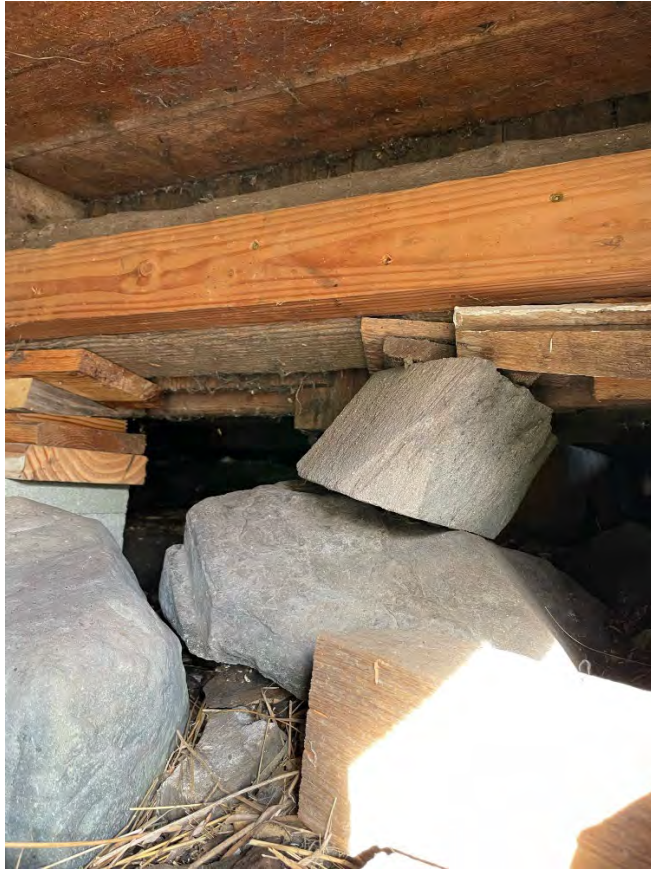
Photo 21. Hmmm, there's some creative carpentry underneath the old residence on the 2022 addition to Watmough Preserve, Lopez.