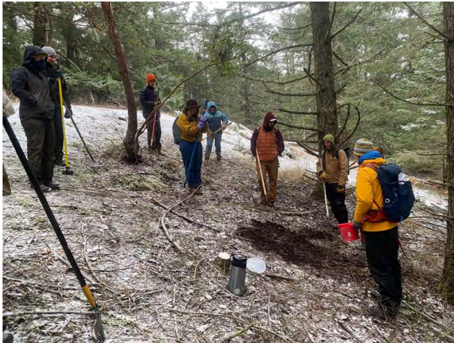
Photo 4. Volunteers brave the snow and wind to prep the ground and sow seeds from the Salish Seeds Project at LSR restoration site on Mount Grant Preserve, SJI.