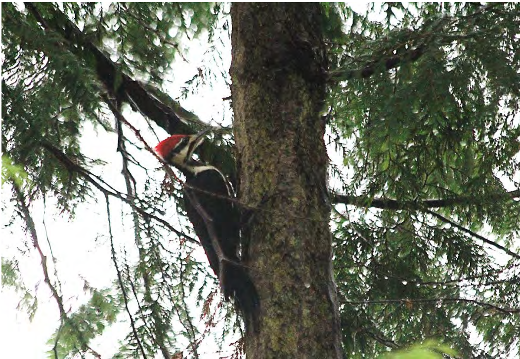
Photo 22. Another creative carpenter, this Pileated woodpecker stewards the SJPT's Ellis Preserve (CE) in rain, snow or shine, Shaw Island.