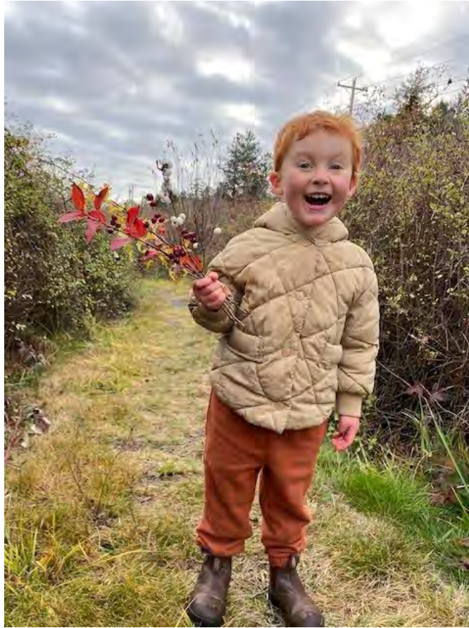
Photo 23. An enthusiastic volunteer helps to brush the trail at Frazer Homestead Preserve to close the season with a smile.

Land Bank staff would like to close the season with a big ‘Thank you’ to our Commissioners and to our Community, for all your generous year-round support.