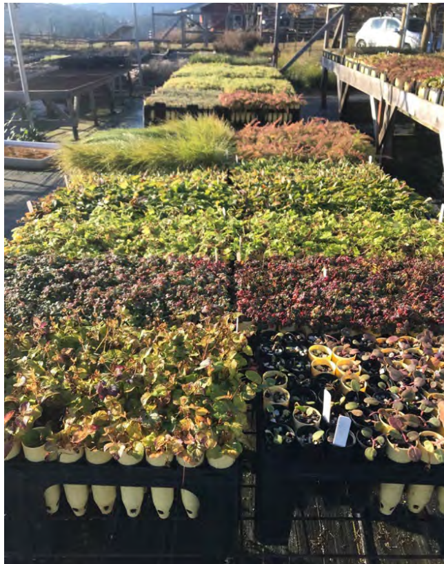
Photo 2. Fall colors at the Salish Seeds Project nursery Red Mill Farm, SJI.