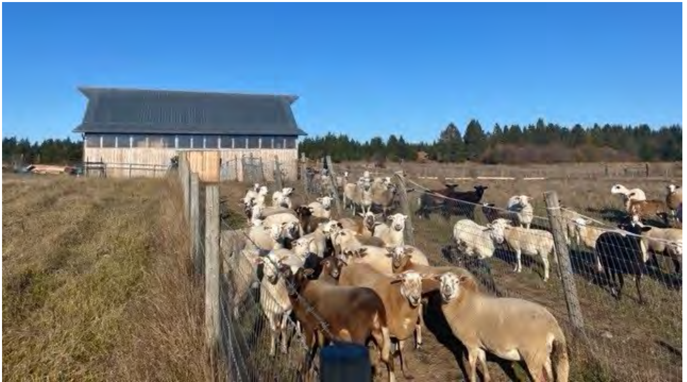
Photo 7. Sheep and barn on Aurora Farm, also called the Twigg-Smith CE, SJI.