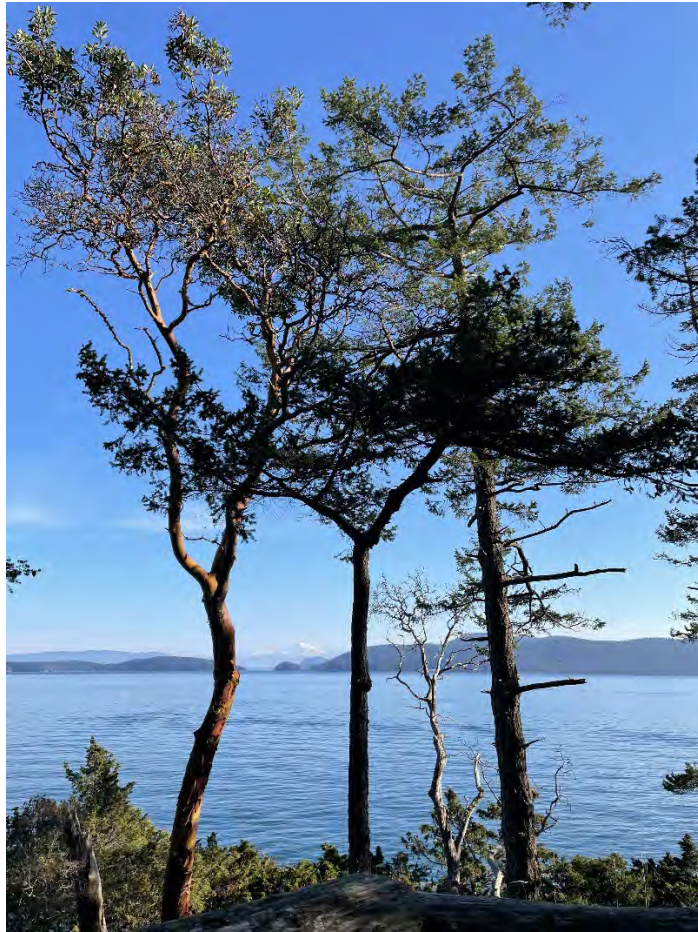
Photo 19. Overlook at Upright Head Preserve, on Lopez Island.