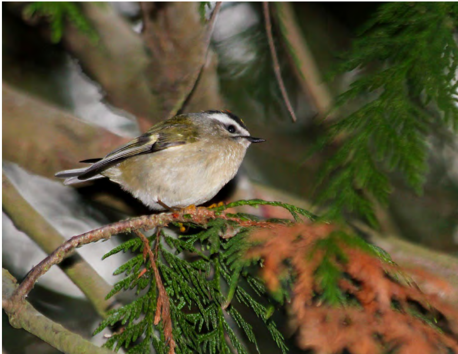
Photo 12. A Golden-crowned kinglet monitors the Coffelt Farm Preserve from a cedar bough, Orcas.