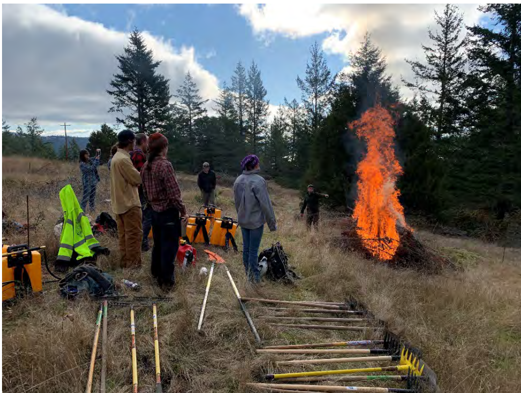
Photo 13. Orcas staff and the ICC crew capitalize on the burn window and combust approximately 200 piles on Turtleback Mountain Preserve, Orcas.