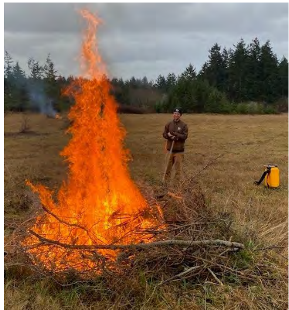
Photos 8 -9. Stewardship staff take advantage of the burn window and tackle slash piles on the upper slopes of the Westside Preserve (left) and Frazer Homestead (right), SJI.