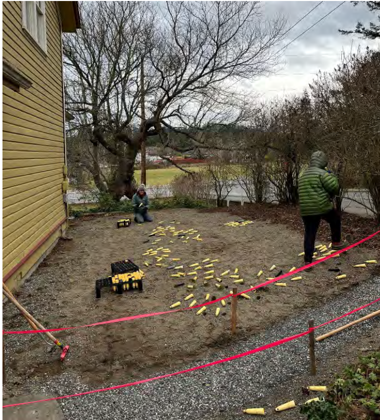
Photo 3. Margo's last day of the season is spent planting the "lawn-to-native-meadow" demonstration area at the Land Bank office, SJI.