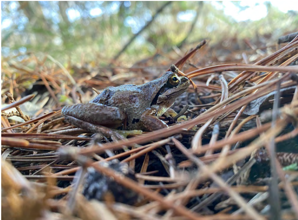
Photo 6. A Pacific treefrog voluntarily monitors the conservation easement (CE) at the SJPT Mosquito Pass Preserve, located on Henry Island.