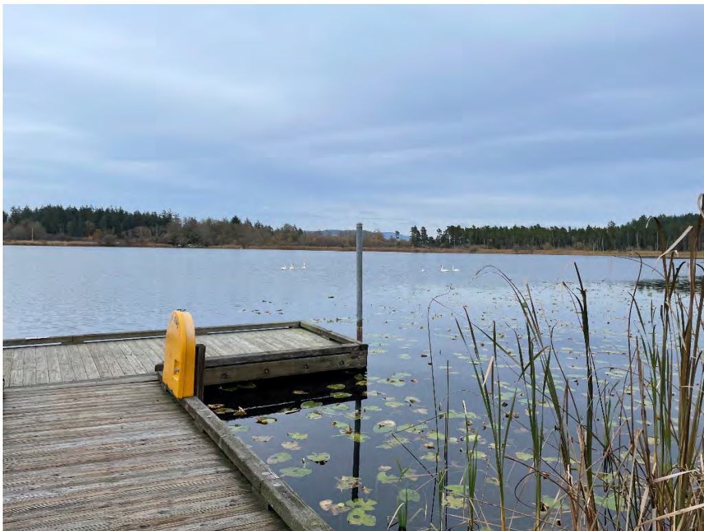
Photo 20. Trumpeter swans enjoy the open water at Hummel Lake Preserve, Lopez.