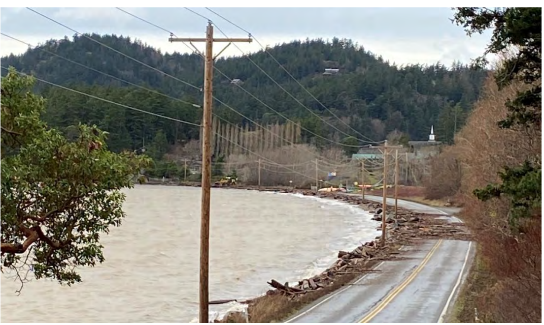
Photo 1. Crescent Beach Road during the king tides and high wind event.