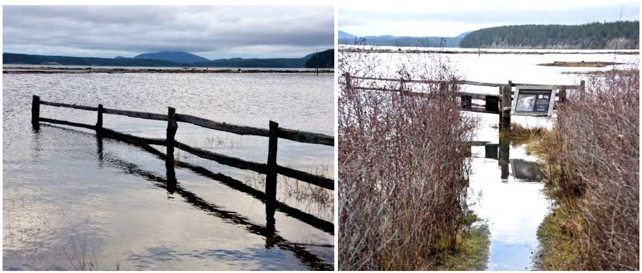
Photos 2-3. A spectacular high tide at the Spit.