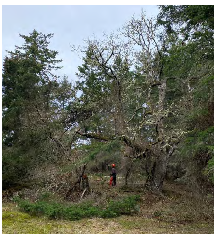
Photo 11. ICC member, Campbell, releases oaks at Turtleback Mountain Preserve.