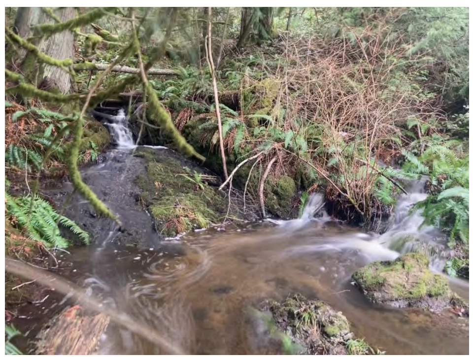
Photo 5. Three Corner Lake stream passing through Cady Mountain Preserve.