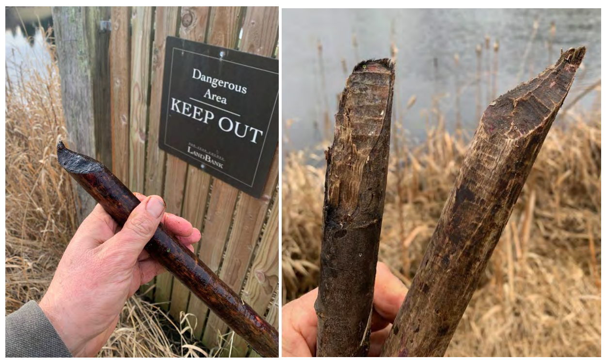
Photos 9-10. A beaver didn't obey the signage at Fowlers Pond and attempted to plug the outlet.