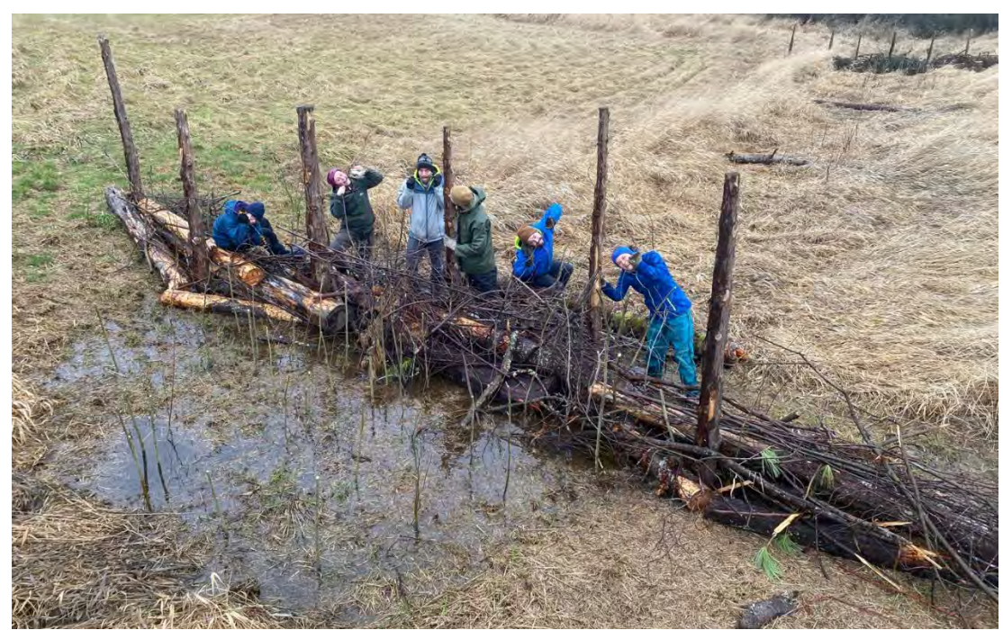
Photo 7. The ICC pose with their best "beaver" face at a newly installed beaver dam analog at Zylstra Lake Preserve.