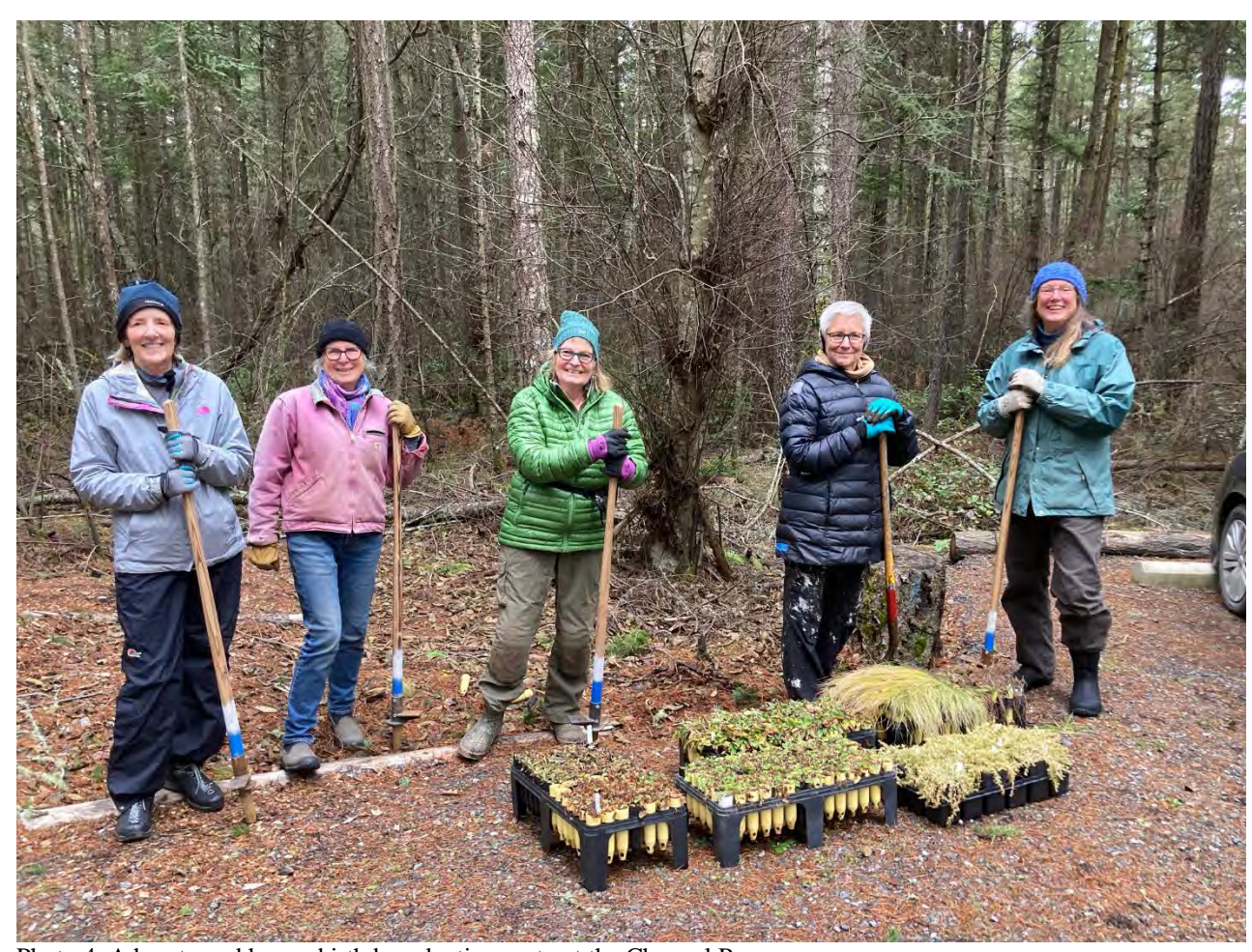
Photo 4. A hearty and happy birthday-planting party at the Channel Preserve.