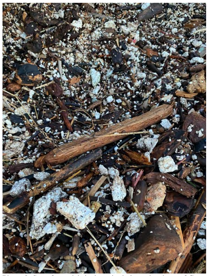
Photo 8. Styrofoam debris deposited along the shore of Crescent Beach Preserve.