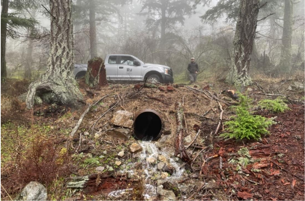
Photo 17. Staff inspect one of 20 new culverts following heavy rains. Several culverts returned flow to seasonal streams that'd been dry since the road was installed many decades ago, Turtleback Mountain Preserve, Orcas.