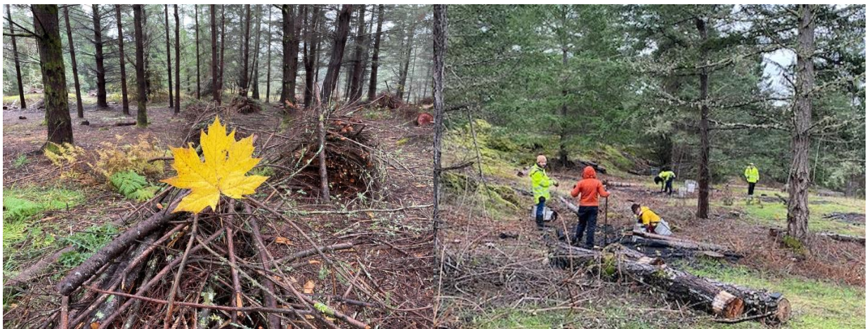
Photos 15 -16. On Turtleback Mountain Preserve, a Bigleaf maple leaf adorns a slash pile (left), as staff and the ICC work to plant over 8,000 native wildflower plugs (right), Orcas.