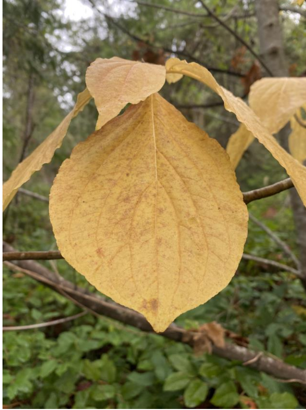
Photo 10. Pacific dogwood, uncommon and admired, at a CE property, Waldron Island.