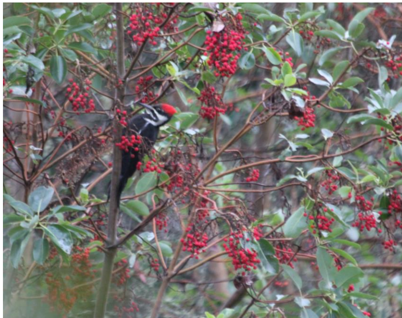
Photo 7. A pileated woodpecker feasts on madrone berries over the holiday season, SJI.