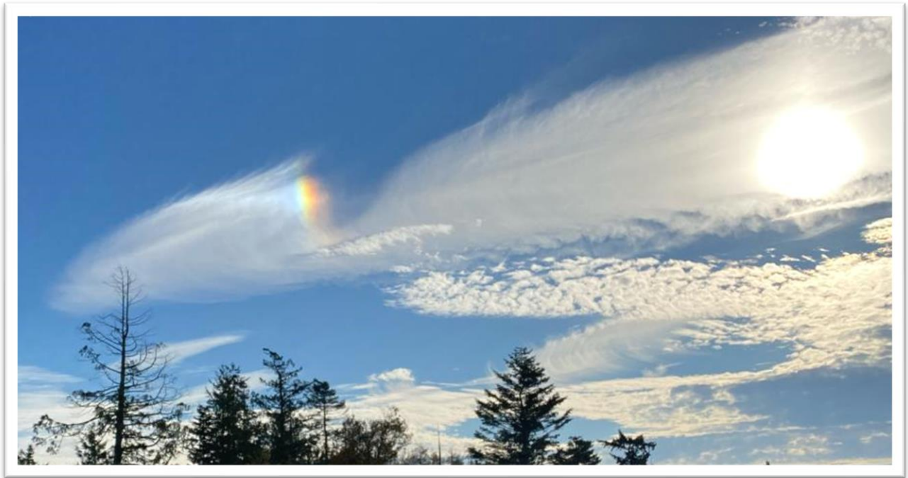
Photo 21. A “sundog” brightens the sky during annual monitoring, Lopez.