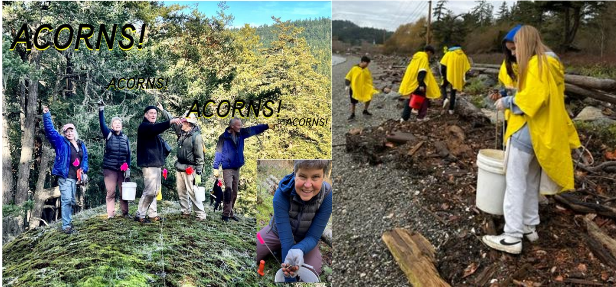
Photos 1-2. Rain and shine, volunteer events occurred across Conservation Land Bank preserves and ranged from planting acorns on Mount Grant (left) to middle schoolers removing trash from Crescent Beach (right).