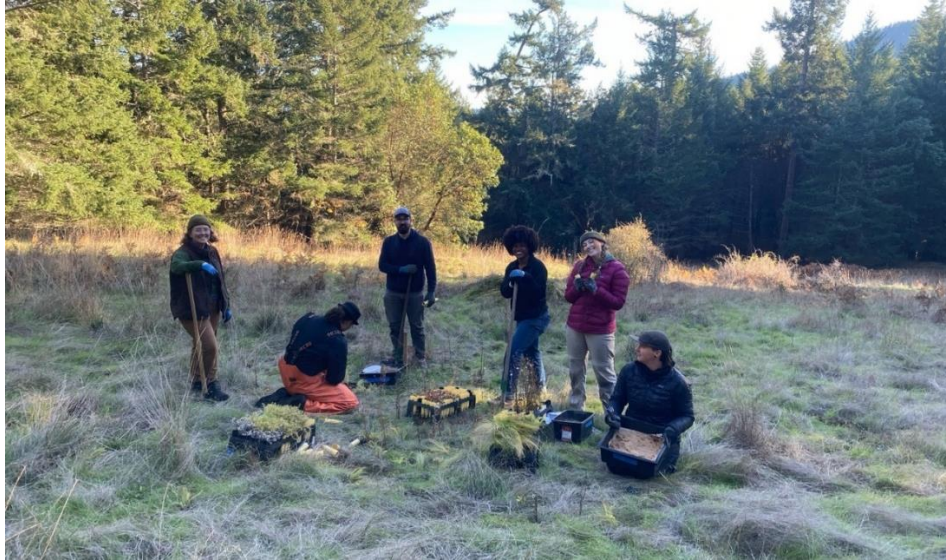
Photo 4. Members of the Samish Tribe and the ICC plant native nursery plugs at Mount Grant Preserve, San Juan Island.