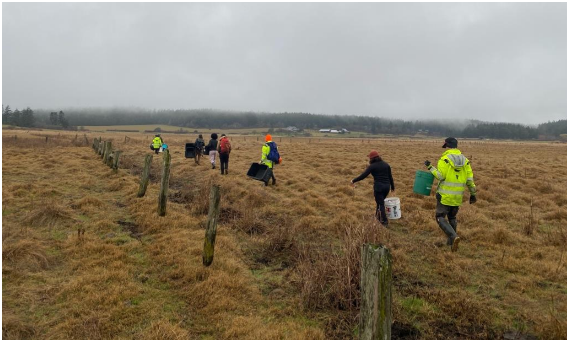
Photo 20. Members of the ICC at Richardson Marsh Preserve, Lopez.