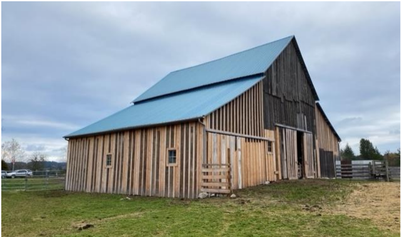
Photo 11. Barn restoration and protected farmland on a CE property, Orcas Island.