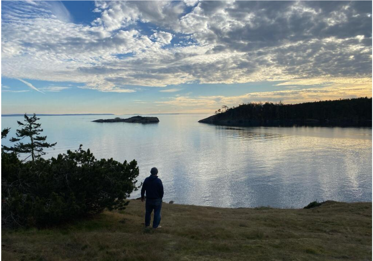
Photo 19. Protected shoreline on a CE property, Lopez.