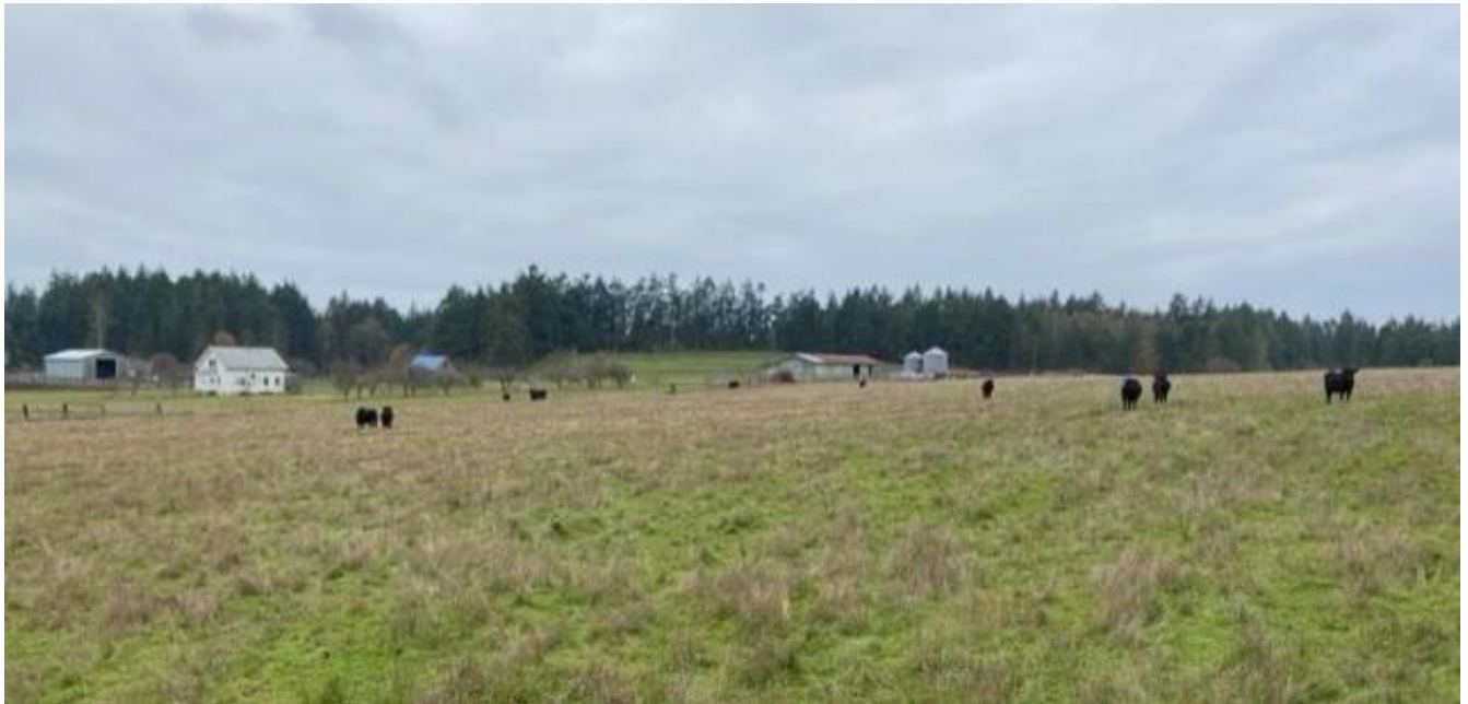
Photo18. Protected farmland on a CE property, Lopez Island.