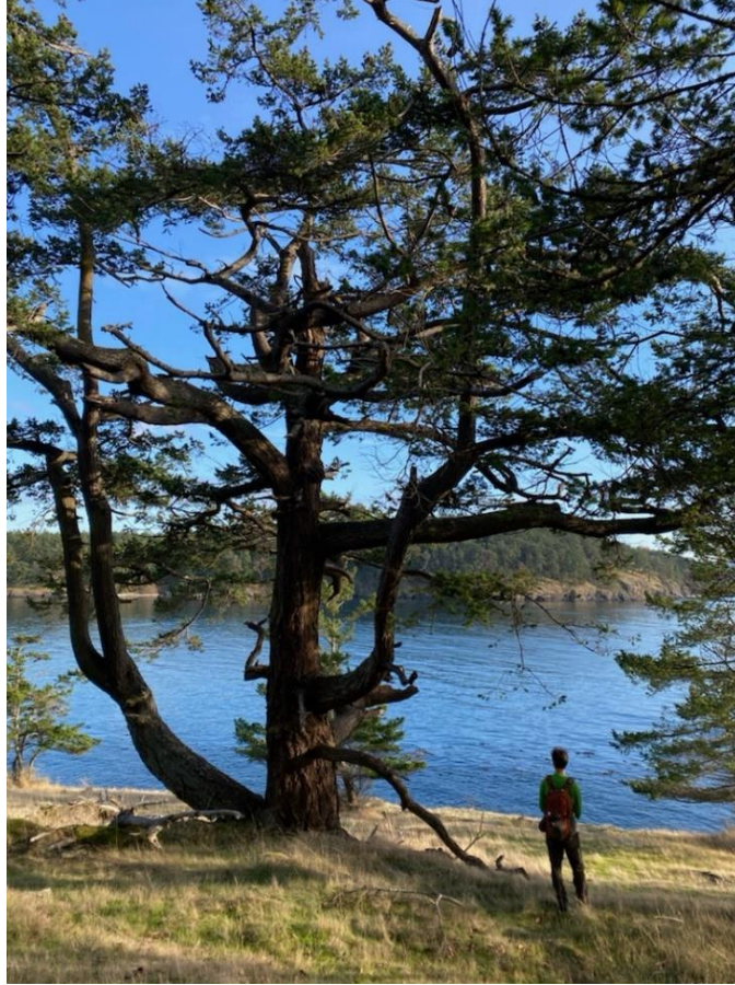
Photo 8. Jacob takes in the view during annual monitoring at Kellett Bluff Preserve, Henry Island.