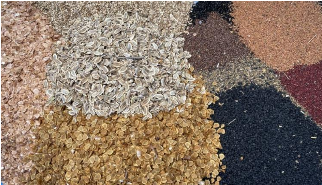
Photo 3: A collage of seeds at the nursery. In 2023, the Salish Seeds Project produced approximately 30 pounds of native plant seed.