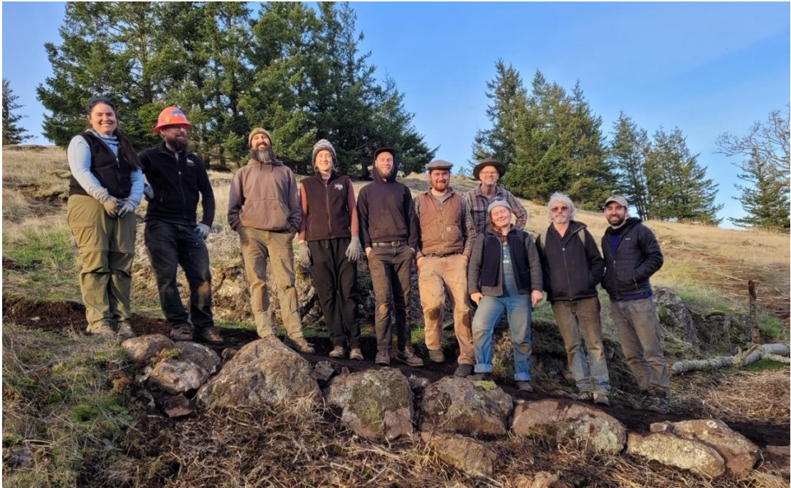
Photo 13. A happy hybrid crew – WTA, Blackcap Restoration, Land Bank staff and volunteers – put on the finishing touches of a new trail segment at Turtleback Mountain Preserve, Orcas