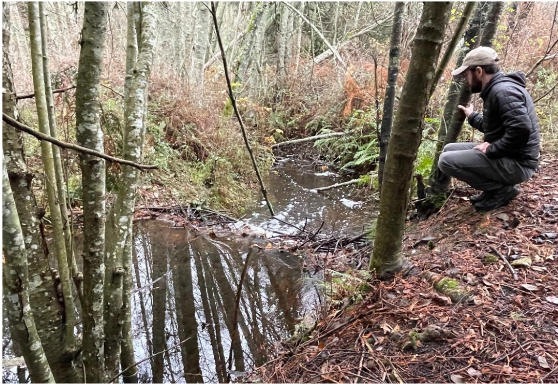
Photo 12. A beaver dam, along with a newly established lodge, signal the return of Castor canadensis to the small watershed that includes Fowler’s Pond and Coffelt Farm Preserves, Orcas.