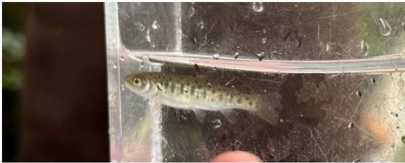
Photo 10. Salmonid fry swim the stream, at Coho Preserve.