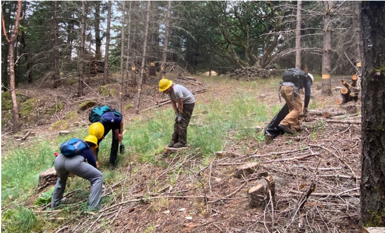
Photo 6. The WCC hunting weeds on Cady Mountain Preserve