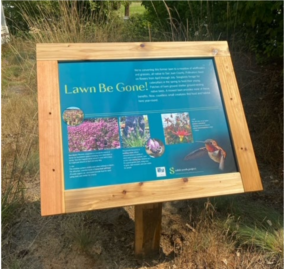
Photo 4. The new sign at Driggs Park showcases the many benefits of planting natives.