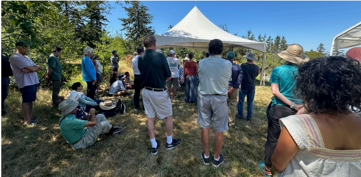
Photo 14. Attendees during the San Juan Preservation Trust's summer social at North Shore Preserve.