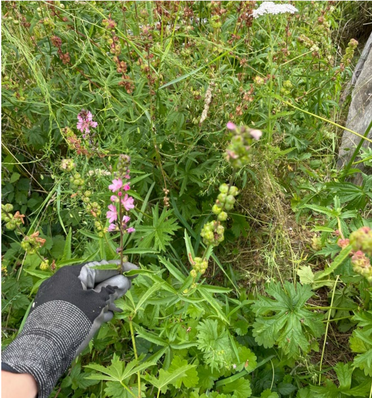
Photo 17. Checkermallow ( Sidalcea hendersonii ) thrives in a deer exclosure at FB Spit Preserve.