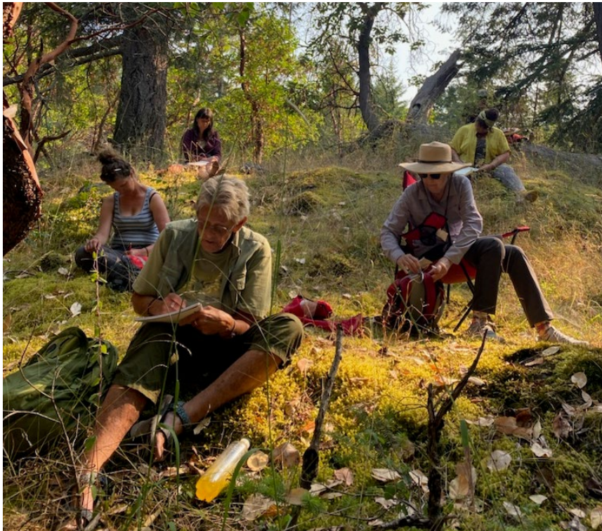
Photo 2. Participants in Poetry of Place workshop hosted by Island Verse Literary Collective at Lime Kiln Preserve.