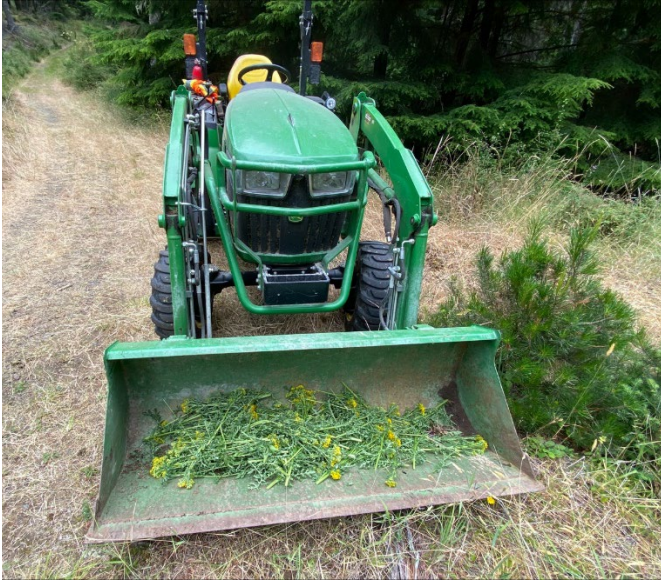
Photo 15. Tansy ragwort removal along Raven Ridge on Turtleback Mountain Preserve.