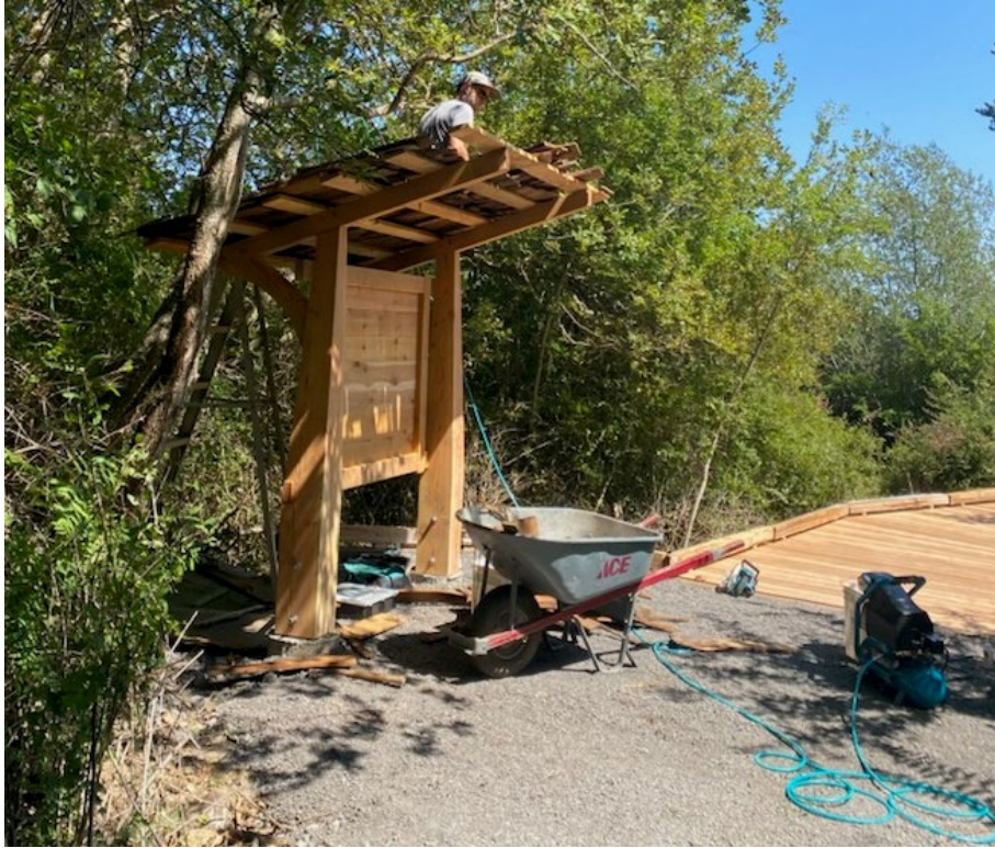
Photo 5. Jacob finishes the kiosk at the Linde-Beaverton trailhead.