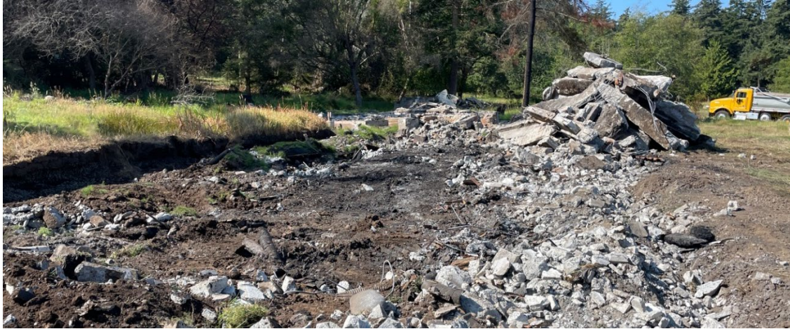
Photo 12. The foundation of the old house was demolished and hauled away, at North Shore.