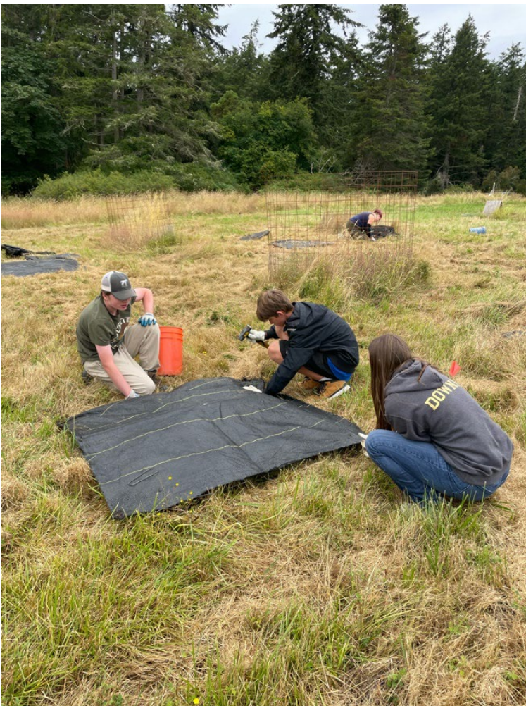
Photo 16. The YCC on Lopez install tarps for the “moveable feast” Island Marble butterfly project, FB Spit.