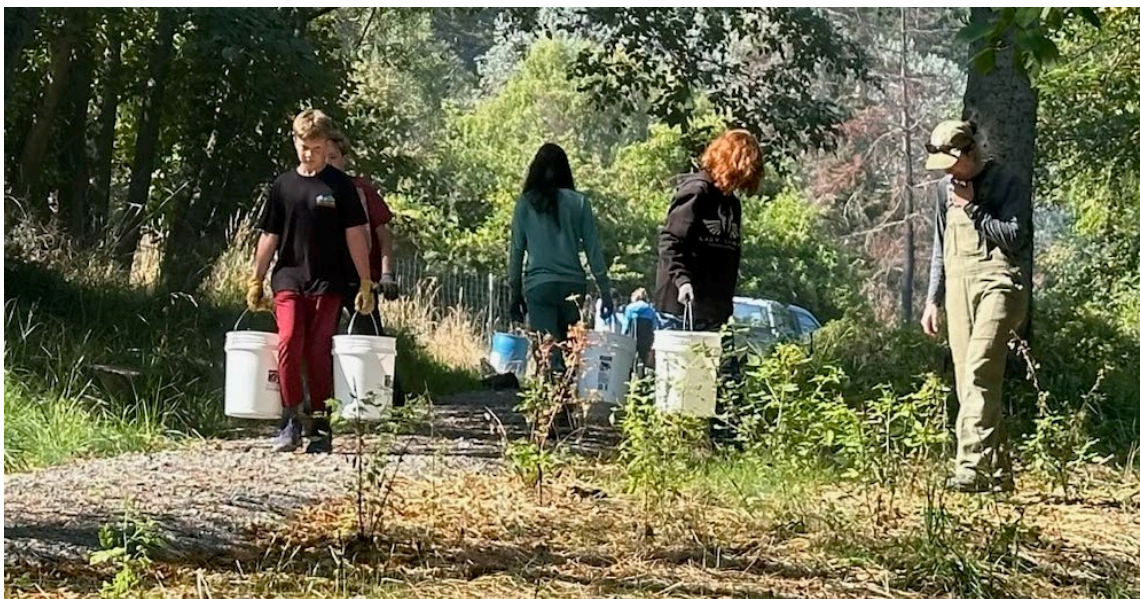
Photo 11. YCC crew members bucket watering plants at North Shore Preserve.