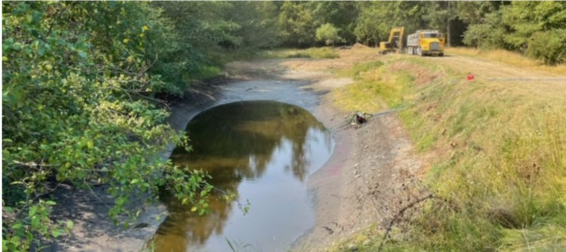
Photo 13. The pond was drawn-down in preparation for the wetland resotration project, at North Shore.