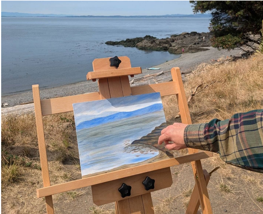
Photo 1. One of the paintings initiated during Alchemy Art Center's plein air class at Deadman's Bay Preserve.