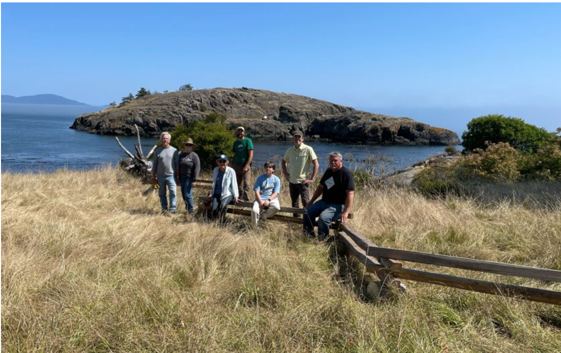
Photo 19. Volunteers help construct a split rail fence on the headland at Watmough Preserve