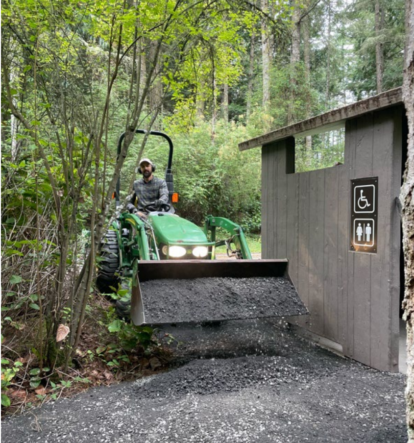
Photo 18. Cedar helps with a variety of the improvements made this month at Hummel Lake Preserve