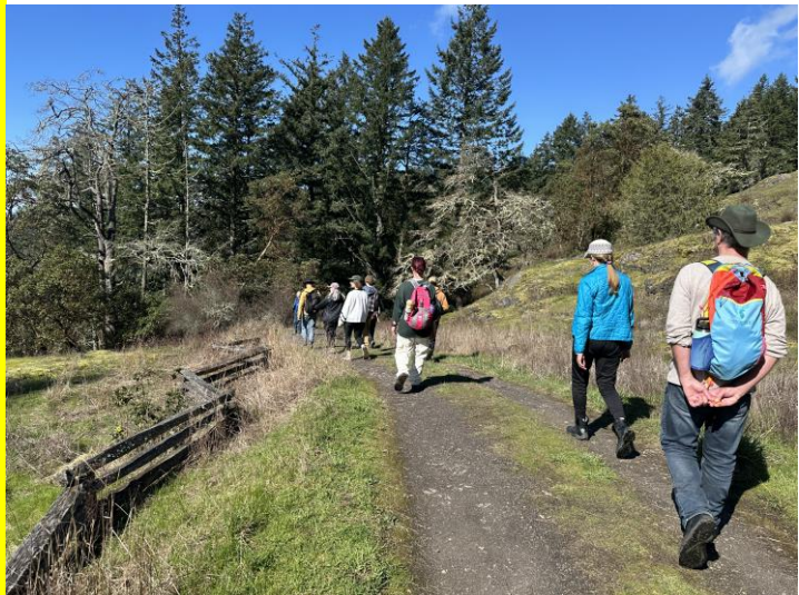
Photo 7. Native bee foraging on currant flower at North Shore. Photo 8. Participants on the March Turtleback march.