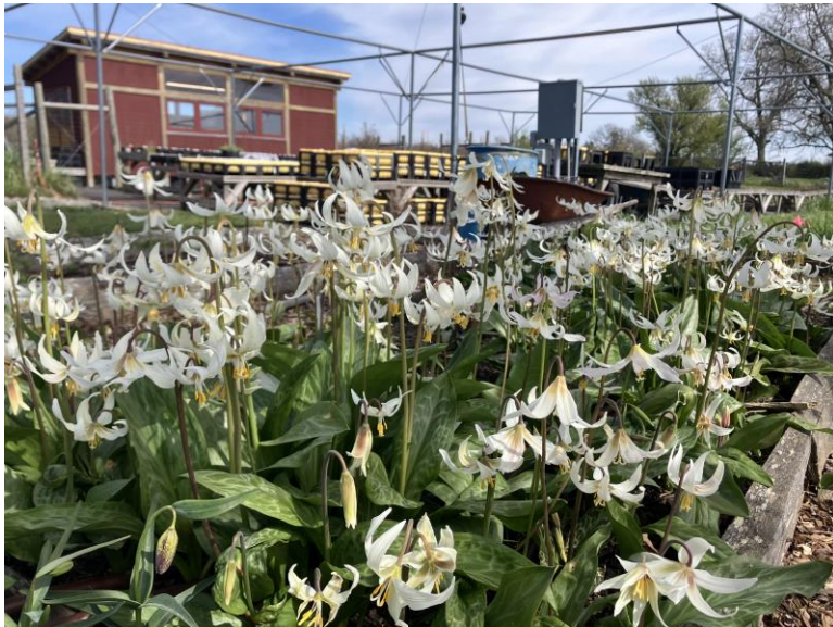
Photo 3. The Salish Seeds Nursery is starting to bloom.