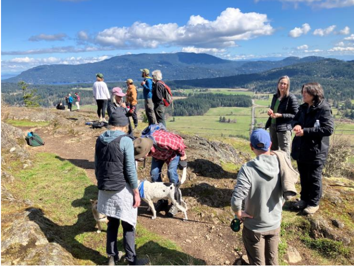
Photo 9. Turtleback March marchers enjoy a perfect spring day on the mountain.