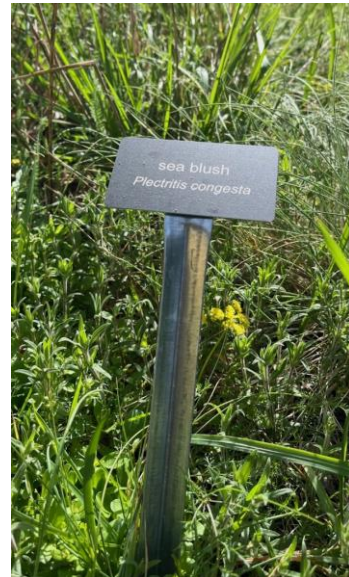
Photo 4. Plant labels have been installed at Driggs Park.