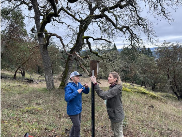
Photo 10. Bluebird box installation on Turtleback with Kathleen from SJPT and volunteer Kristin